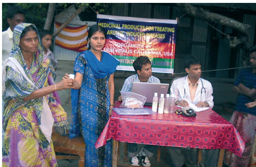
Awareness and cure

Less suffering, lower cost for illness and more productivity will contribute immensely to the societies that are presently afflicted.